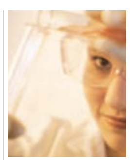
Healthcare, the sciences