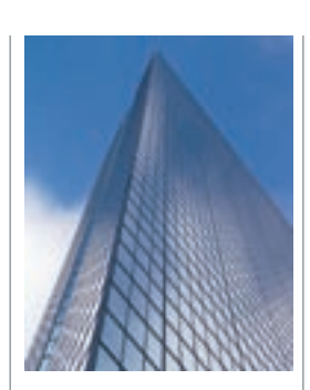
HVAC / Building management