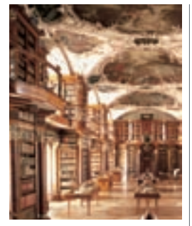
Museums, art galleries

The HygroPalm2-series (with integrated or interchangeable probes) is ideal for all applications where exact measurement of humidity and temperature is of decisive importance, e.g. the food and pharmaceutical industries, printing and paper industries, many trades, the sciences, meteorology, agricultural sector, climatology, etc. There is hardly a field today in which these parameters may be ignored. It is ultimately the measuring task at hand that defines the HygroPalm instrument that best meets your needs.