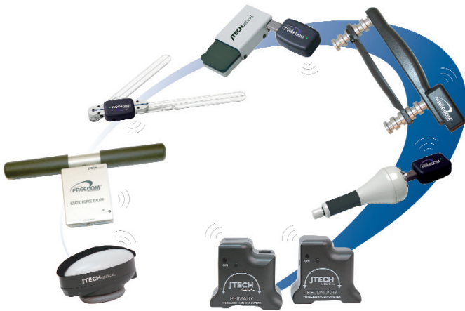
Wireless IsoTrack also available